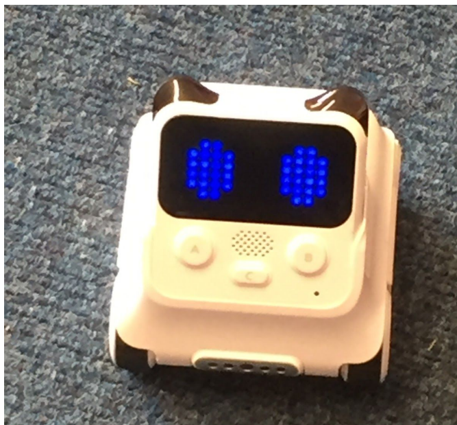
Codey & Rocky