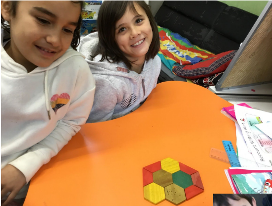
Tia and Aaliyah are using hexagons and trapezoids to make a bigger hexagon

Tupu Tuakana are currently learning all about shapes and patterns in our Geometry unit. They are having a great time exploring some of the different ideas about shapes and enjoy the hands on learning that we are doing.