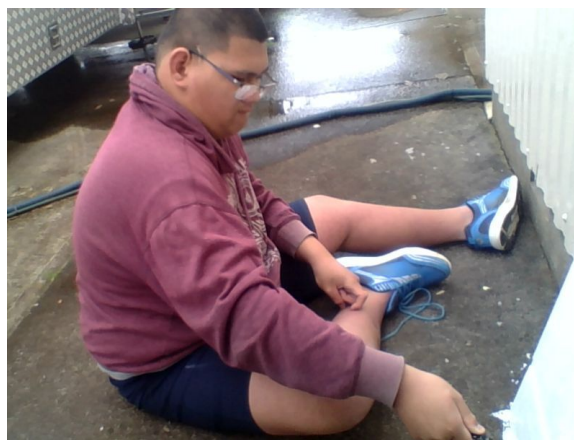
Getting my paint on for the base of my library.