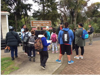
Early morning tour