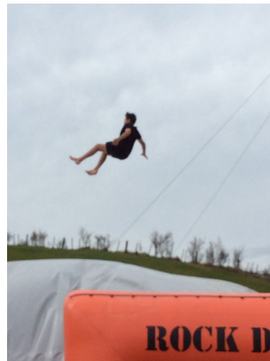
Maihi rock diving