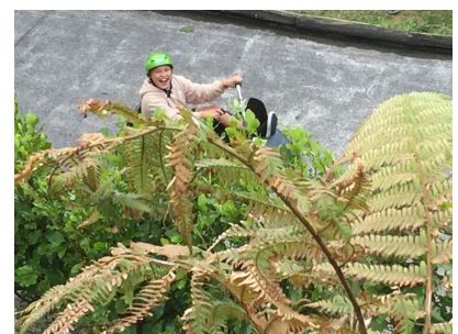
Kani breaking the land speed record.