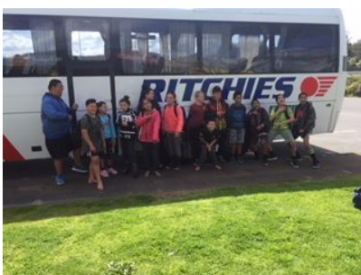
Pit Stop - Mercer