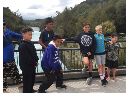
The boys at Huka Falls