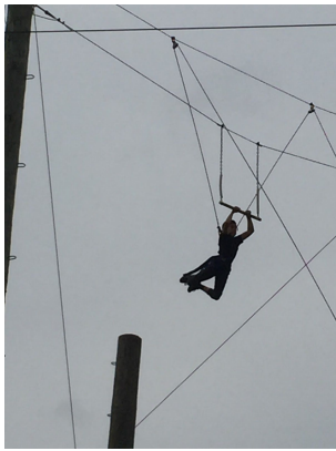
Herbie nailing the trapeze