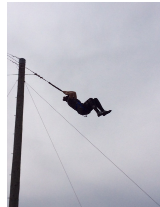
Carmel swing in the breeze