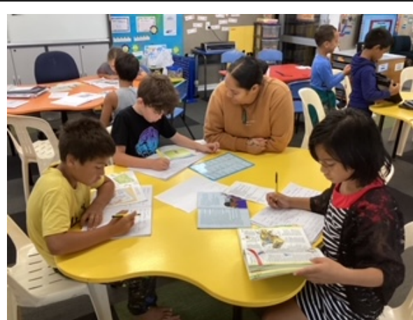
Mana and Thyme are retelling a story with support from Whaea Roche.